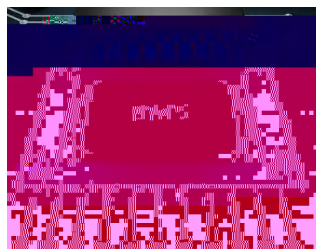
9 D J '